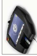
Large, 10" LCD screen