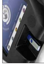
USB key & Ethernet