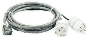
TO MOLD TO FRAME